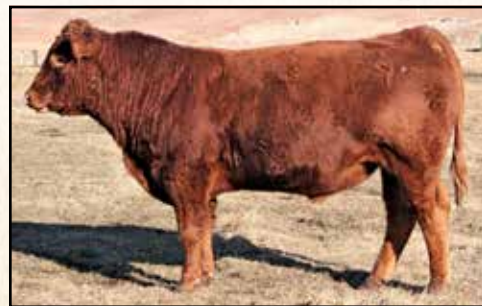
BRAW BC 8233F LFM2153017 Calving ease Specialist – Loaded with muscle- LimFlex