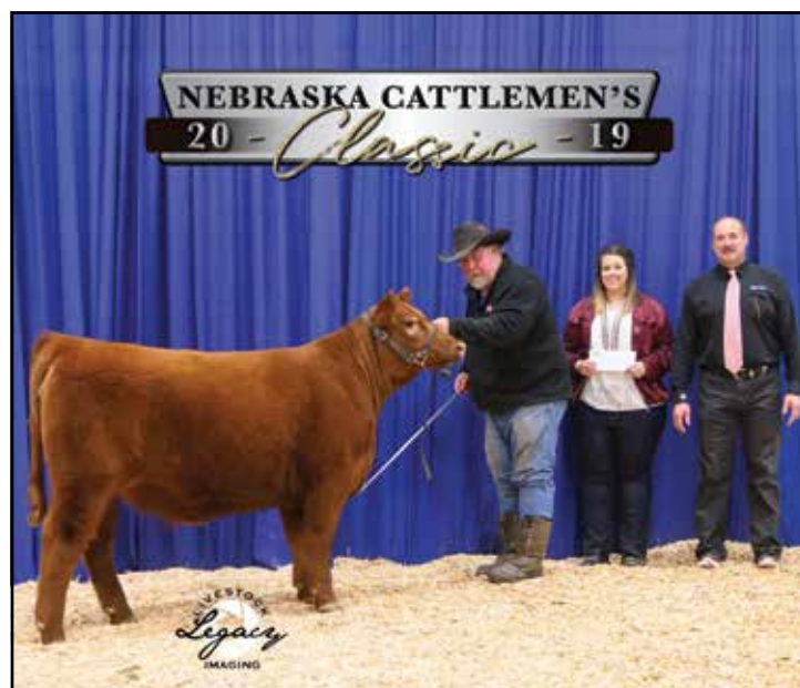
2019 Reserve Grand Champion Red Angus heifer at the Nebraska Cattlemen's Classic exhibited by Bullis Creek Ranch

Over the three-year period for which data was collected, buyers consistently placed value on GridMaster index, HerdBuilder index, and yearling weight EPD. It is logical that there were high correlations between sale price and the economic selection indices reported by RAAA, as indices are powerful selection tools that utilize economically relevant traits to predict profitability in various production scenarios. Between the two economic selection indices, the most emphasis was placed on GridMaster index. Among the EPD correlations, growth traits had higher correlations with sale price than other reported EPD. It can also be noted that ultrasound back fat and ultrasound rib eye area had strong correlations with sale price for both years that this data was recorded. Based on this, it can be inferred that customers paid a higher price for bulls that were phenotypically more fleshy and heavier muscled.