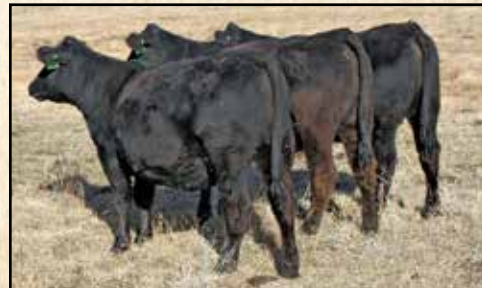
COMMERCIAL BRED HEIFERS All sired by LFLC Big Country out of top Angus dams- They sell AI bred to Werner Flat Top (Angus)- The resulting calves will be 3/4 Angus and 3/4 sibs