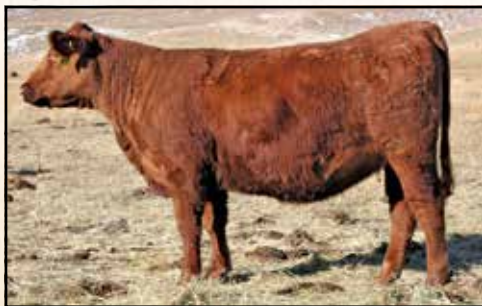
BCRR LAKOTA 827F 3943631 Bred Stockman- Top 10% Herdbuilder- Top 22% Gridmaster- Sparticus x Trilogy