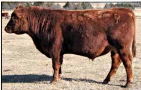
BCRR DEFENSE 893F 3943543 RAVN Defense son- Top 9% Herdbuilder Top 28% Gridmaster- Famed Miss Wix family