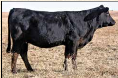
BRAW MS DEWDROP 8252F LFF2153035 Sired by KCF Bennett Fortress – A leader in 13 traits