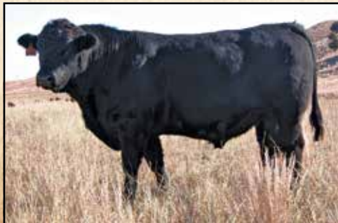
BRAW DEFEND 8242F LFM2153026 68 BW – 718 Adj WW – Wulfs Defend x GAR Predestined (AN x LM)- 75% LimFlex